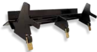
Kwik Rips also available